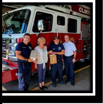
HCHC PROVIDES SMOKE DETECTORES TO HC FIRE DEPARTMENTS