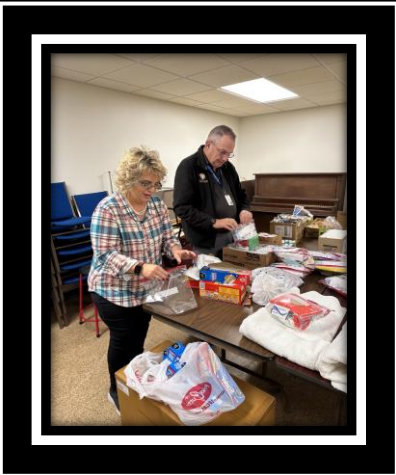
H.C. HOMELESS KITS