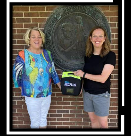
HCHC PROVIDES AED MACHINES TO LOCAL CHURCHES